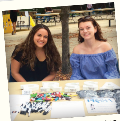
PUBLIC RELATIONS & ADVERTISING