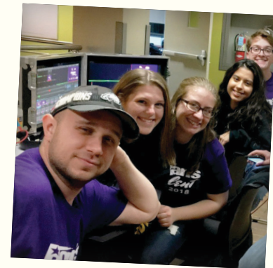
RADIO/TV & FILM