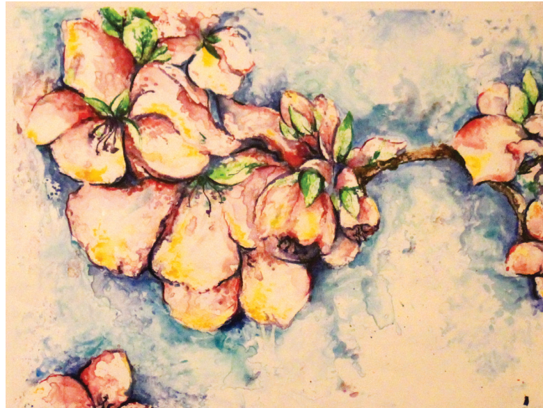
Leann Carlson After Rain Watercolor monotype